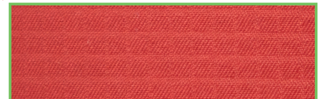
ACTIVE DRY POLY