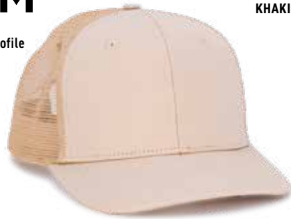
SHOWN IN KHAKI