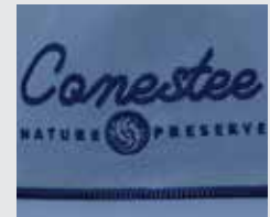
FLAT PEARL CHAIN STITCH EMBROIDERY Base cost + $1.50