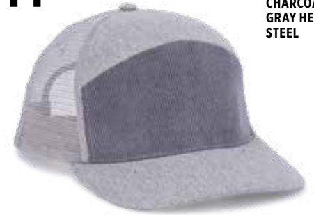
SHOWN IN CHARCOAL GRAY HEATHER STEEL