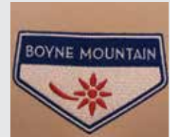
SOLID FLAT FILL EMBROIDERY W/ FLAT EMBROIDERY OUTLINE First location included in base cost