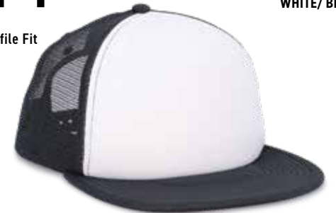
SHOWN IN WHITE/BLACK