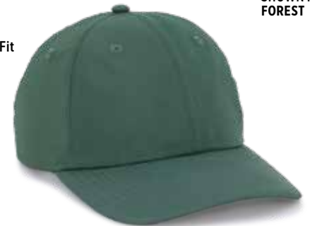
SHOWN IN FOREST