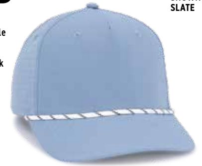
SHOWN IN SLATE