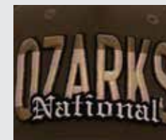
3D PUFF RAISED EMBROIDERY Base cost + $4.00

Additional embroidery locations, digitizing fees apply.