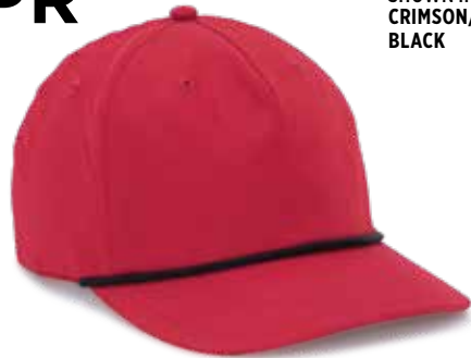
SHOWN IN CRIMSON/ BLACK