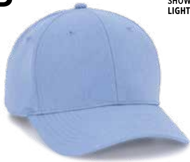
SHOWN IN LIGHT BLUE